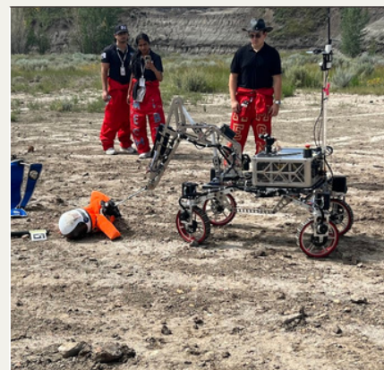
MARS & MURDER

Inspected a decommissioned reactor site, evaluated salvage, viability, and assessed environmental hazards.